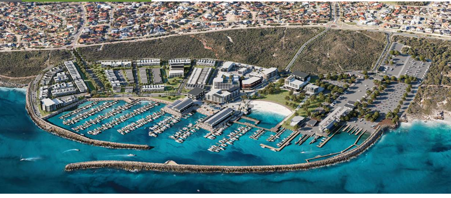
An artist's impression of the Ocean Reef Marina will look.