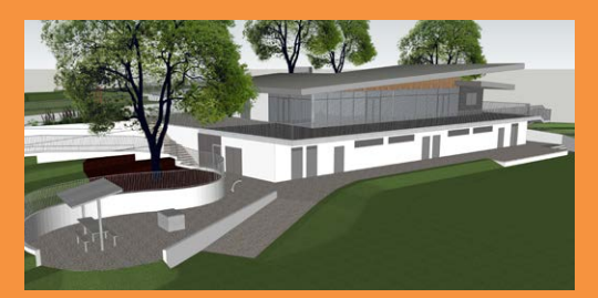
An artist's impression of how Chichester Park will look.