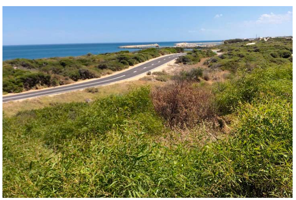
Coastal Shared Path Upgrade – West View Boulevard, Mullaloo to Ocean Reef Marina.

As well as benefitting the residents of the cities of Joondalup and Wanneroo, it is hoped this path link will increase visitors numbers to the northern coastal corridor.