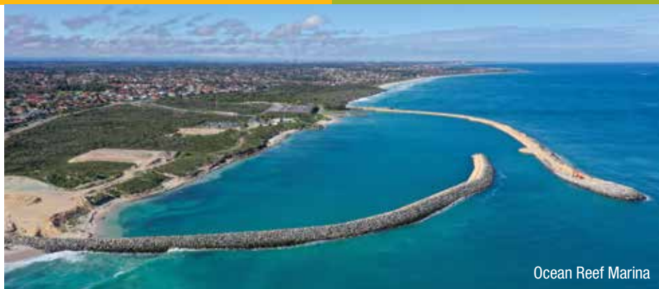
Ocean Reef Marina

The southern breakwater has also reached its final length, with work continuing to bring it up to its final height of about 8m. This is expected to be completed in mid-2023.