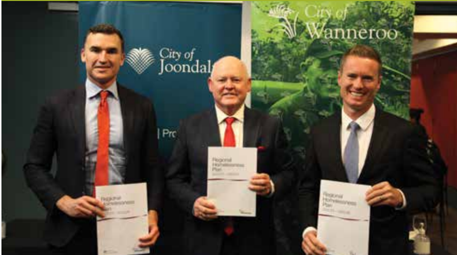
Minister for Housing; Lands; Homelessness and Local Government, John Carey, Wanneroo Deputy Mayor Brett Treby and Joondalup Mayor Albert Jacob with copies of the Regional Homelessness Plan.

The Cities of Joondalup and Wanneroo launched their 2022/23-2025/26 Regional Homelessness Plan during Homelessness Week 2022 (1 – 7 August)