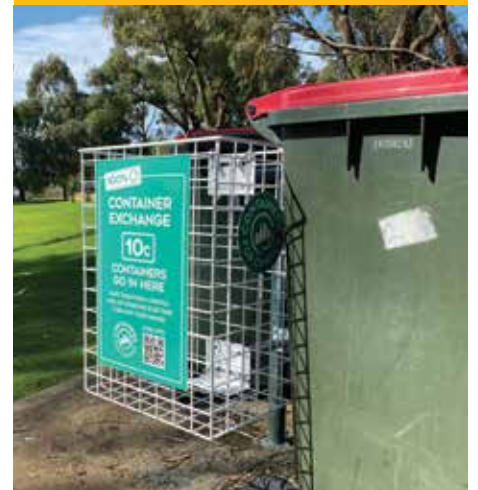
The containers for change baskets are located in and around the City's parks.

The City has installed Containers for Change exchange points across the City to reduce the amount of waste going to landfill and to help committed recyclers raise money. So far, exchange points have been installed at Neil Hawkins Park, Joondalup; Tom Simpson Park, Mullaloo; Hillarys Beach Park; Burns Beach Park; Iluka foreshore; Sorrento foreshore and Mawson Park, Hillarys. It is hoped that members of the community will recycle their containers at these sites instead of disposing them in a bin destined for landfill. Collectors can then take the container from the basket and gain the 10c refund.