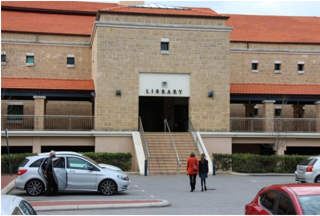
This is the Joondalup Library.