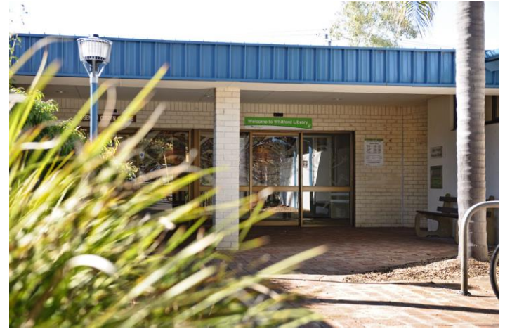
This is the Whitford Library.