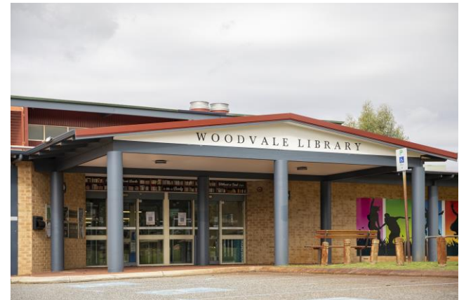
This is the Woodvale Library.