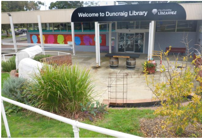
This is the Duncraig Library.