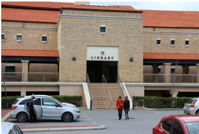
This is the Joondalup Library.