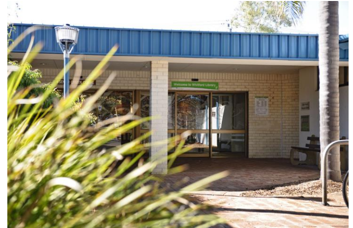
This is the Whitford Library.