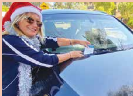
One of Santa's little helpers issues a caution notice during the 12 Days of Christmas.

The City spread some Christmas cheer in the lead-up to 25 December 2022 by handing out gift vouchers to motorists who parked correctly during the 12 Days of Christmas ( Monday 14 December 2022 – Sunday 25 December 2022 ). Christmas cautions were also issued as part of the campaign.