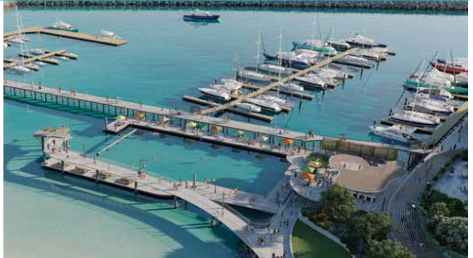
Artist's impression for illustrative purposes only.

Last month, Joondalup Council approved the execution of the Ocean Reef Marina Development Agreement and Land Transfer Deed. The result