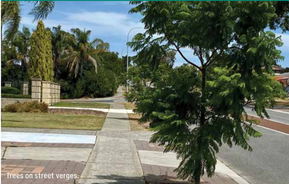
Trees on street verges.

The City of Joondalup Leafy City Program provides increased urban canopy cover by planting trees within our suburban streetscapes, to create cooler urban spaces for residents.