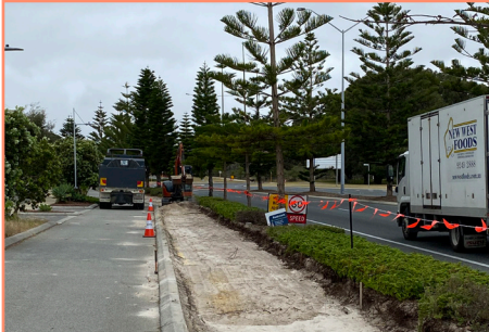
Hepburn Avenue, Hillarys