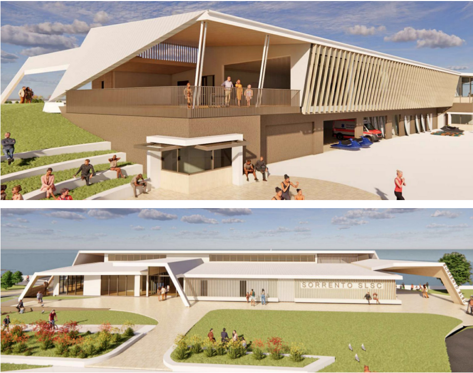
An artist's impression of how the redeveloped building could look.

The redevelopment of the Sorrento Surf Life Saving Club facility has taken a step forward after Joondalup Council approved the concept design at its November meeting.