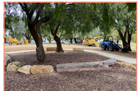
Elcar Park, Joondalup – dog park

An outdoor café extension is underway. Visitors will soon be able to enjoy their food and drinks outside, protected from the elements. Sessions at Craigie will continue to operate during the project.