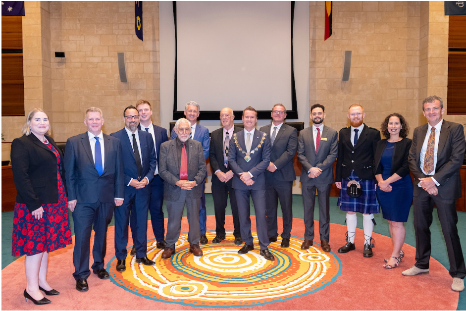
The new Council (pictured) was sworn in on Wednesday 25 October.

The 2023 Local Government Election in October resulted in two candidates being re-elected to the Joondalup Council, and four new elected members.