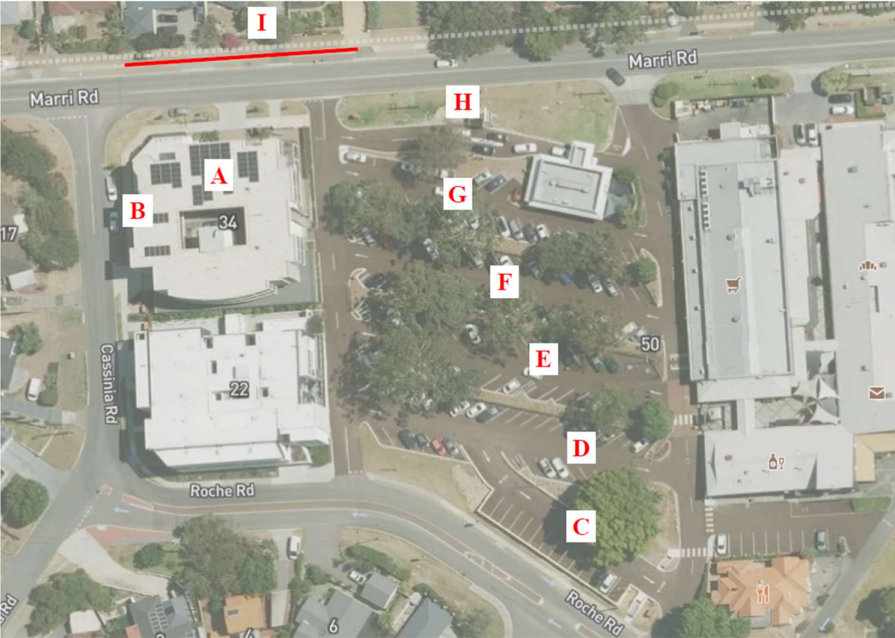
Figure 1: Parking Beat Survey Zones 2024

Project: Little H Café 2024 Parking Survey